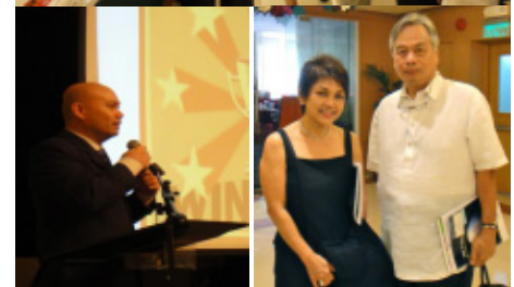
Scenes from the presentations, registration, fellowship and report from the President.