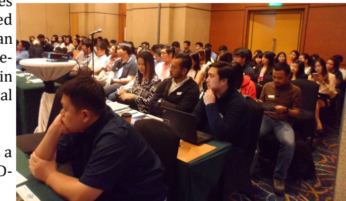
continued on page 4

opment Expert, asked the audience on how ready it is to embrace the changes happening both nationally and globally. He called for his audience to think about the implications on business and industry of a technology that has made data more ac-