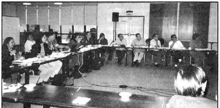
Participants listening attentively to speakers.