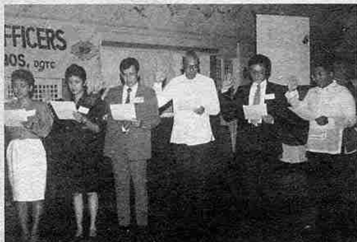
The 1990 ORSP Officers taking their Oath of Office.