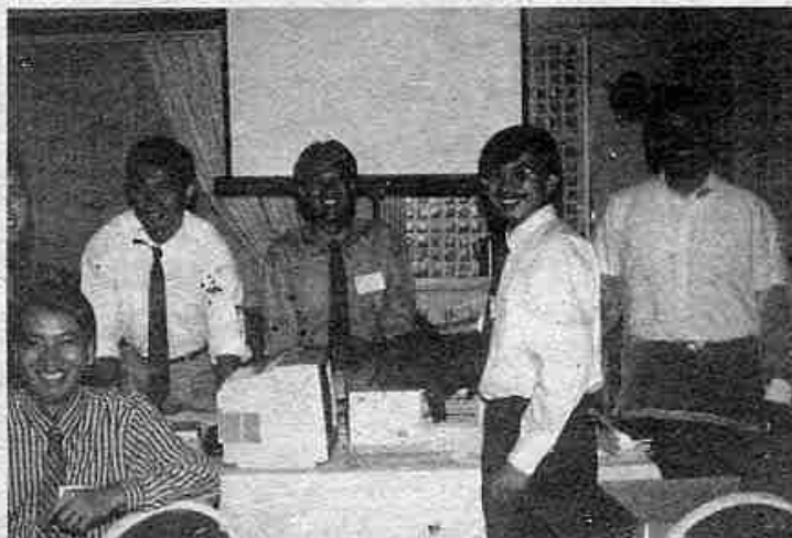
PLDT busy bodies with Ms. Punzalan, ORSP Auditor.